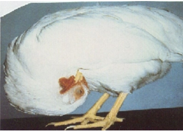
Example of depression associated with Newcastle Disease.

Additional information on poultry diseases can be found here and here .