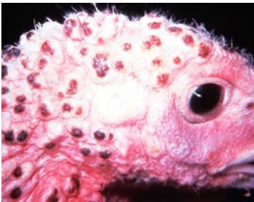
Example of the dry pox type of Avian Pox (commonly referred to as Fowl Pox).

A UF/IFAS Publication on poultry diseases can be found here .