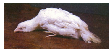
An example of the flaccid paralysis caused by Botulism (ingestion of the toxin from Clostridium botulinum ).