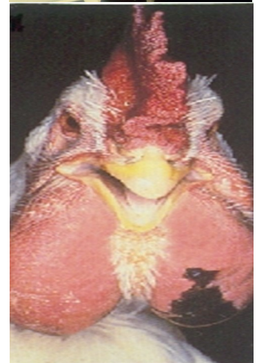
Swollen wattles associated with Fowl Cholera.