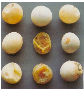
Example of malformed eggs from a hen with Newcastle Disease.