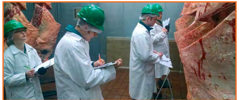
The Suwannee County 4-H Meat Judging Team members judge beef carcasses at a practice at the University of Wyoming in January 2017.

Meat judging team participants and parents were sent a survey regarding their experience in the meat judging program. Youth responses included: "the meat judging team helped me be more confident in talking about my