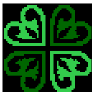
Baker County 4-H Agent

4-H is a community of young people across America who are learning leadership, citizenship and life skills.